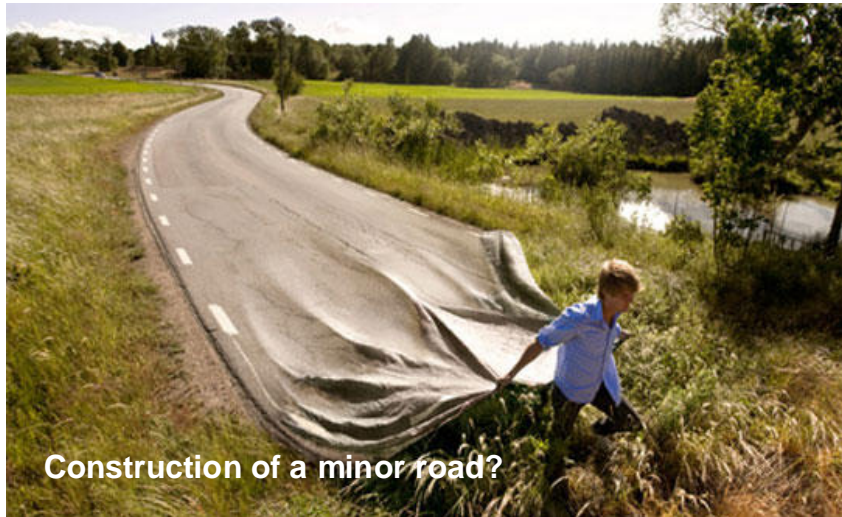
Construction of a minor road?